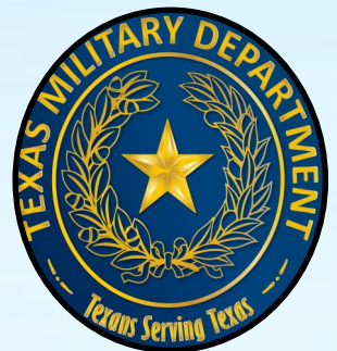
TEXAS MILITARY DEPARTMENT DEPARTMENT

Officers in the rank of O1, O2, WO1, and CW2 receive a Free one-year membership in NGAT. All enlisted personnel in all ranks receive a Free one-year membership in NGAT. (3)