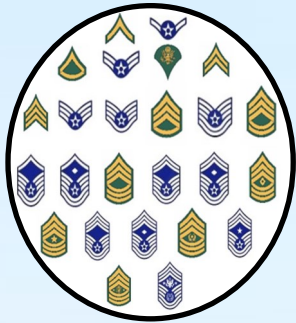
ENLISTED PERSONNEL (ALL RANKS)

Receive a Free one-year membership in NGAT & EANGUS. (1)