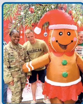
CHRISTMAS IN THE GUARD