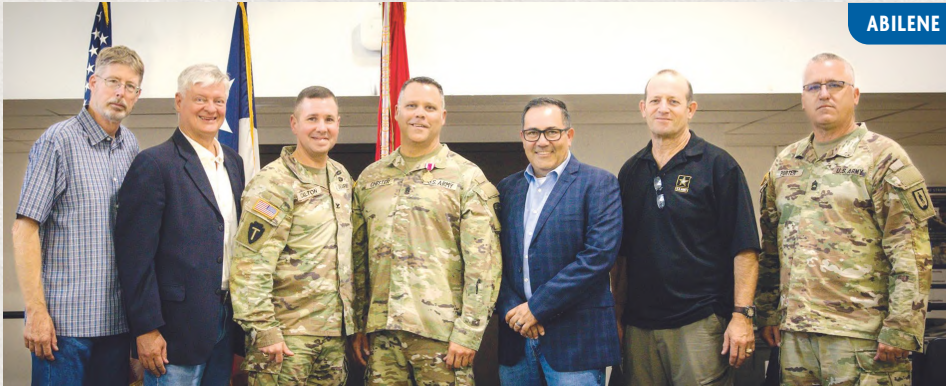
THE LONE STAR CHAPTER OF THE MILITARY INTELLIGENCE CORPS ASSOCIATION hosted its annual MICA Ball on November 2, 2024. This special event brought together military intelligence Soldiers, associates, and retirees from across Texas for an evening of networking, camaraderie, and recognition of excellence within the MI Corps.