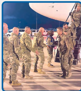
DUTY | HONOR | TEXAS