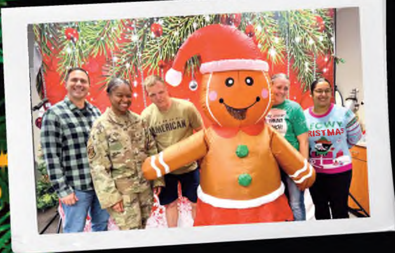
Members of the 272nd Engineering and Installation Squadron celebrate the Christmas holiday during drill in Houston, Texas.