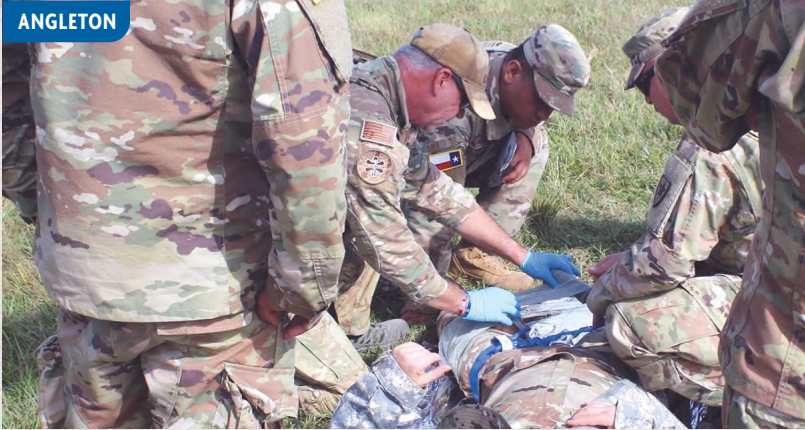
GUARDSMEN FROM ALPHA COMPANY , 4th Battalion, 2nd Brigade, Texas State Guard, practice providing aeromedical evacuation support with the assistance of National United States Armed Forces Museum personnel and their CH-46 helicopters in Angleton, Texas, Nov. 16, 2024.