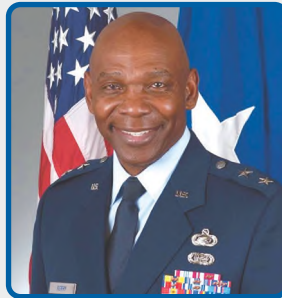
NGAT CONFERENCE UPDATE