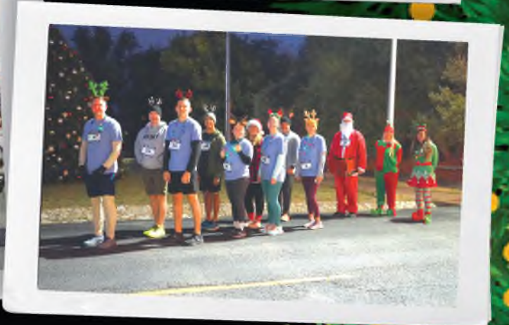
The Texas Adjutant General hosted his Annual Holiday party at Camp Mabry which included a 5K fun run, a competitive BBQ Competition and a Christmas tree decorating contest.