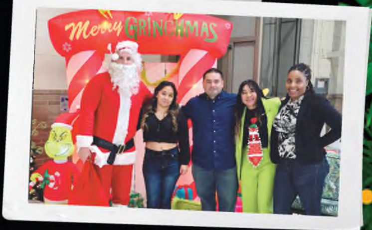
Members and family members of HHC 449th Aviation Battalion in San Antonio visits with Santa during their Christmas drill.