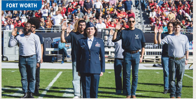
LT COL CAMILLE LADREW , 136th Airlift Wing executive officer, stands ahead of recruits swearing into the U.S. Air Force at the 2024 Lockheed Martin Armed Forces Bowl in Fort Worth, Texas, December 27, 2024. During the game, each branch of the Armed Services were represented as recruits swore into their respective branches.