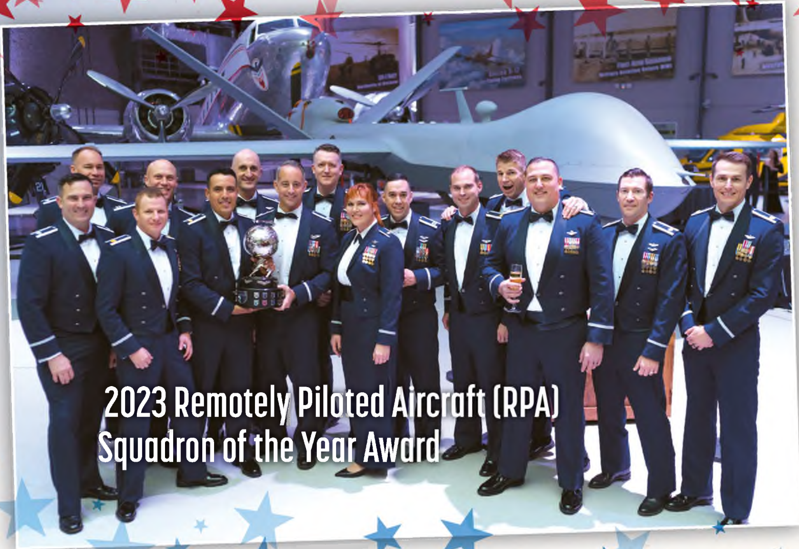
2023 Remotely Piloted Aircraft (RPA) Squadron of the Year Award